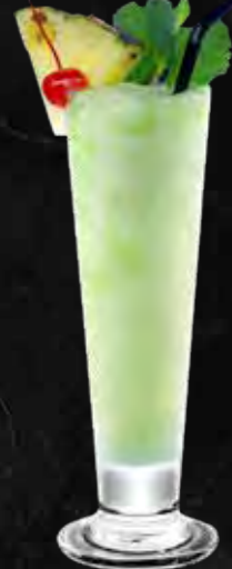
PINEAPPLE MINT LYCHEE DAIQUIRI $18 (JUG $36) ★★★★★

Our house red wine with seasonal fruit, raspberry liqueur, cinnamon and lemonade.