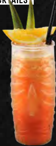
MAI TAI $18 (JUG $36) ★★★★★

Kinn mojito is a cocktail consisting of refreshing citrus and mint flavors are intended to complement the potent kick of Rum.