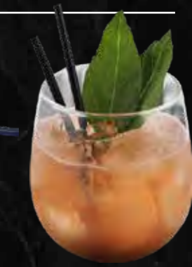
HO-RA-PA $18 ★★★★★

This cocktail is mixed from almond flavoured liqueur mixed with fresh lemon juice, dash of sugar syrup, egg white and shaken until the perfect consistency. Top with red wine.