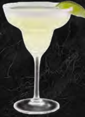
MARGARITA $19 ★★★★★

Light Rum, pineapple juice and coconut cream