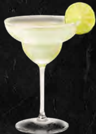
VIRGIN MARGARITA $13

Fresh lemongrass, mint, fresh lime smashed and topped with soda.