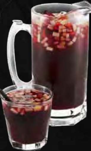
KINN SANGRIA $35 (JUG) ★★★★★

Blue agave tequila, Thai Basil, hint of raspberry and freshly squeezed lime juice