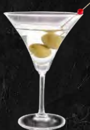
DRY MARTINI $17 ★★★★★

The Cappuccino Martini is a cocktail made with vodka, kahlua, black coffee and top with cream.