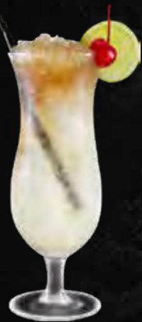
LONG ISLAND ICED TEA $18 (JUG $36) ★★★★★

Add Vodka, fresh lime juice into a glass with ice. Top with ginger beer.