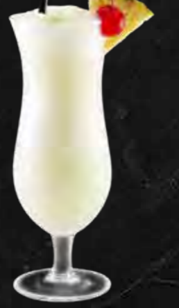
PINA COLADA $17 ★★★★★

The mai tai is a Rum based cocktail mixed with orange liqueur, tropical fruits juice and lime juice.