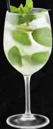
MOJITO $17 (JUG $34) ★★★★★

Kinn mojito is a cocktail consisting of refreshing citrus and mint flavors are intended to complement the potent kick of Rum.