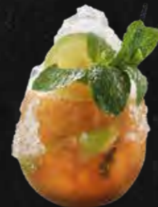
CAIPIRINHA $17 ★★★★★

The Caipiroska, also known as Caipivodka is a cocktail made with vodka, fresh lemon juice and peach syrup