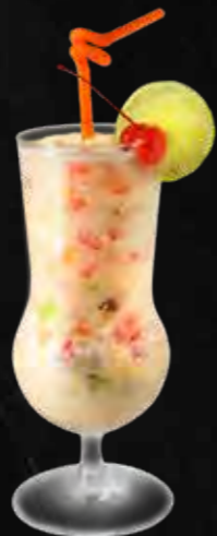
YAKULT PIPO JELLY $12

Pineapple juice, coconut juice and coconut milk