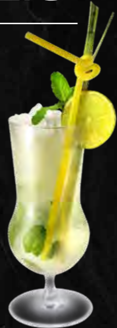
LEMONGRASS SMASH $13

Pineapple juice, passion fruit, touch of citrus and dash of grenadine.