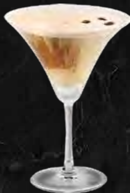
CAPPUCCINO MARTINI / ESPRESSO MARTINI $18 ★★★★★

Brazil's national cocktail made with cachaça, brown sugar and lime.