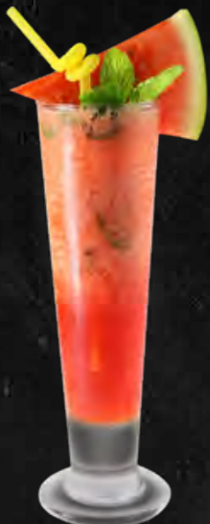
SWEET VALENTINE'S $13

Its combination of Yakult, refreshing citrus and topped with jelly fruit.