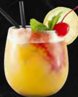
1984 $17 ★★★★★

Wild strawberry, bailey's, strawberry liqueur and finish with cinnamon.