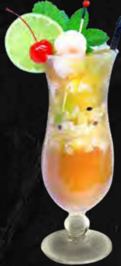
PASSION FRUIT CAPRIOSKA $18 ★★★★★

The spritz is a popular ritual! It is undoubtedly the most widespread and commonly drunk Aperitif in Italy a traditional ice-breaker and symbol of a lively atmosphere.