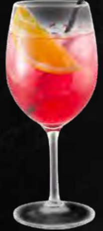
APEROL SPRITZ $17 ★★★★★

A generous mix of Vodka, Peach Schnapps and both orange and cranberry juice. Top with blue Cognac liqueur of Kinn Thai style