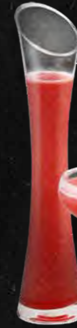
RED ANGEL $20 ★★★★★

Vodka, strawberry and lime juice mixed with a small dose of Chambord. This cocktail adds a little Extra to every ladies style.