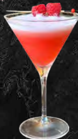
CLOVER CLUB $18 ★★★★★

Bombay Sapphire Gin, Pimm, fresh mint, orange wedges and lashing of ginger beer.