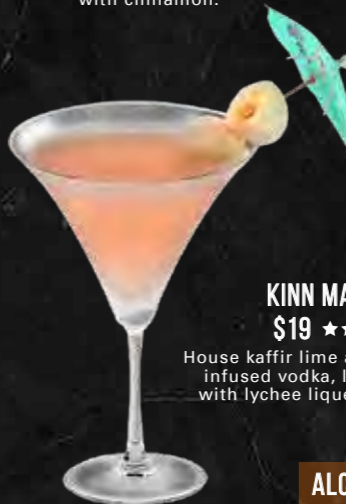
KINN MARTINI $19 ★★★★★

Fresh raspberry, Gin, Lemon juice egg white