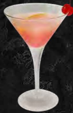
DAIQUIRI $17 ★★★★★

Tequila mixed with orange flavoured liqueur and lime juice often served with a salt rim.