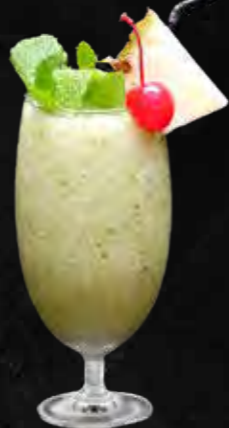
PINEAPPLE MINT LYCHEE $13

Plenty of Lychee, touch of apple and citrus.