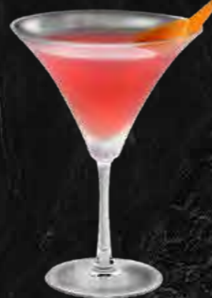
COSMOPOLITAN / COSMO RASPBERRY $18 ★★★★★

The whisky sour is a mixed drink containing JW Gold Label Reserve, lemon juice, sugar and a dash of egg white. It is sometimes called A Boston Sour. It is shaken and served over ice