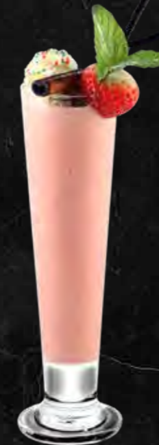
SUGAR DADDY $19 (JUG $38) ★★★★★

Malibu, bacardi, midori shaken with pineapple juice & topped with lemonade