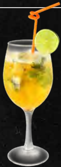
PASSION FRUIT MOJITO $12

Passion fruit mojito is a mocktail consisting of refreshing citrus and mint flavors are intended to complement the potent kick of the passion fruit.