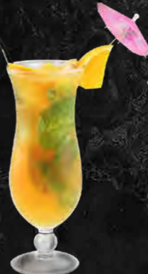
PIMM NO. 1 $17 (JUG $34) ★★★★★

The martini is a cocktail made with gin and vermouth, and garnished with an olive and a lemon twist. Over the years, the martini has become one of the best-known mixed alcoholic beverages.