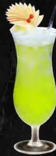
BABY GIRL $17 (JUG $34) ★★★★★

Vodka, strawberry and lime juice mixed with a small dose of Chambord. This cocktail adds a little Extra to every ladies style.