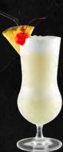
VIRGIN PINA COLADA $13

Lemon juice, simple syrup, salt rim the glass and twist with lemon peel make this drink refresh energy.