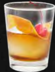
OLD FASHIONED $17 ★★★★★

Fresh lime, passion fruit, lychee, cane sugar and rum