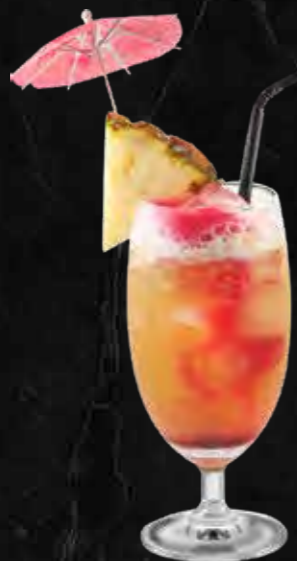
KOH SAMUI SUNRISE $12

Passion fruit mojito is a mocktail consisting of refreshing citrus and mint flavors are intended to complement the potent kick of the passion fruit.