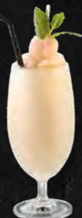
LYCHEE LYCHEE $12

Fresh watermelon blended with mint and hint of exotic fruit.