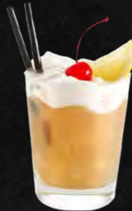
WHISKY SOUR / AMARETTO SOUR $18 ★★★★★

The Old Fashioned is a cocktail made by sugar with bitters, then adding bourbon 101 proof and a twist of citrus rind. It is traditionally served in a old fashioned glass.