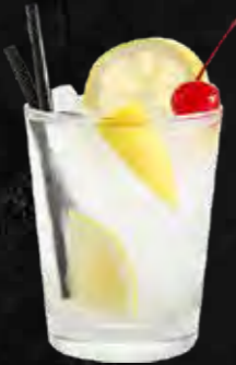
PEACH CAIPIROSKA $17 ★★★★★

As the name suggests this cocktail originated in the city of Babylon in Long Island. A summer drink with a perfect mix of Vodka, Gin, Rum, Tequila, Cointreau with sour mix and a dash of coke