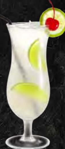
MOSCOW MULE $17 ★★★★★

A cosmopolitan is cocktail made with premium Vodka, Cointreau, cranberry juice and freshly squeeze lime juice.